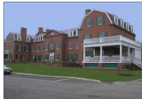
Best Structural Masonry & Design Project Flinn Hall & Edelman Hall Hotchkiss School - Lakeville, Connecticut Architect: Robert A M Stern Architects Mason Contractor: Lombardo Bros. Masonry, LLC CM: O & G Industries, Inc. Owner: Hotchkiss School Engineer: DeStefano Associates