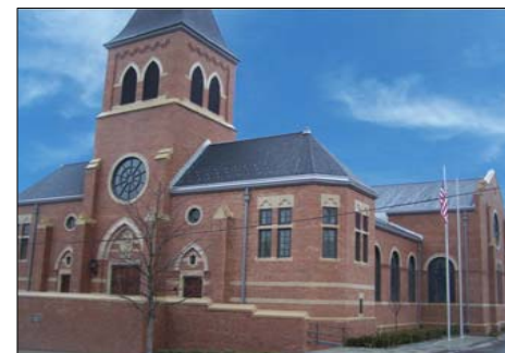
Institutional Category - Churches Sacred Heart Parish Church Weymouth, Massachusetts Architect: The S/L/A/M Collaborative Mason Contractor: Commercial Masonry Corporation Owner: Roman Catholic Archdiocese of Boston Engineer: The Collaborative Engineers