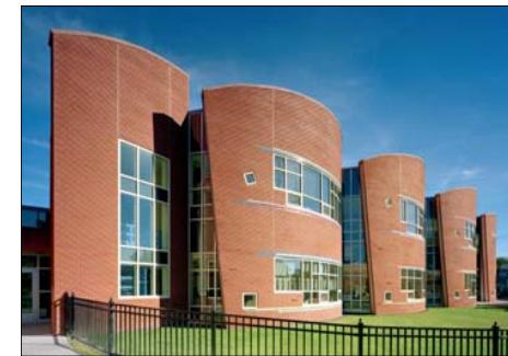
Best Contemporary Design Project - Brick John S. Martinez Elementary School New Haven, Connecticut Architect: Svigals + Partners, LLP Mason Contractor: B.W. Dexter II, Inc. Owner: City of New Haven CM: Fusco Corporation Engineer: Michael Horton Associates, Inc.