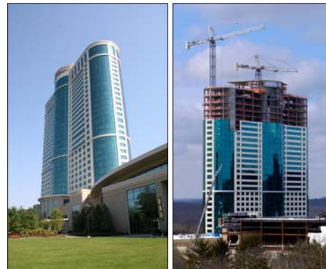
Special Award Project - Concrete Construction Foxwoods Casino MGM Grand Hotel Ledyard, Connecticut Manafort Brothers, Inc.