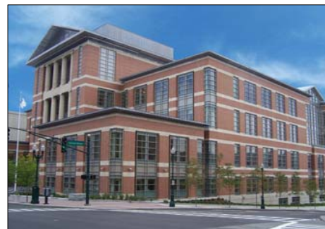
Institutional Category - Courthouses New Worcester Trial Court Worcester, Massachusetts Architect: Shepley Bulfinch Richardson & Abbott Mason Contractor: G.N. Prunier & Sons, Inc. CM: Gilbane Building Company Owner: Commonwealth of Massachusetts Engineer: Lee Lim Associates