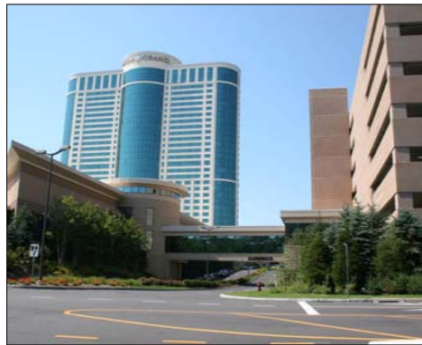
Special Award Project Foxwoods Casino MGM Grand Hotel Ledyard, Connecticut Architect: HKS, Inc Owner: Mashantucket Pequot Tribal Nation CM: Perini Building Company Engineer: Cagley Harman & Associates