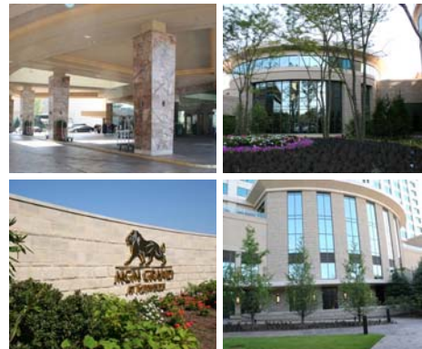
Special Award Project - Stone Masonry Foxwoods Casino MGM Grand Hotel Ledyard, Connecticut B.W. Dexter II, Inc.