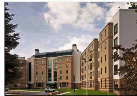
Best Sustainable Design Project New Residence Hall at Rhode Island College Providence, Rhode Island Architect: RGB Design Studio Mason Contractor: Costa Brothers Masonry Inc. CM: Bacon Construction Company Owner: Rhode Island College Engineer: Odeh Engineers, Inc.