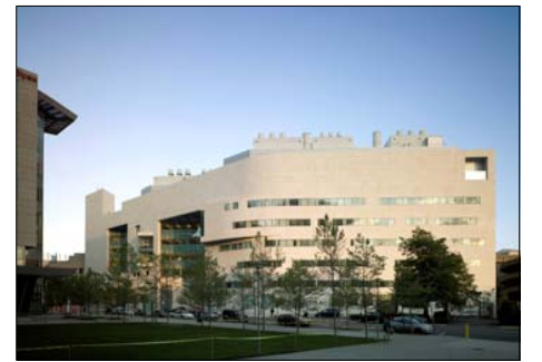
Best Contemporary Design Project - Stone Brain and Cognitive Sciences Complex, MIT Cambridge, Massachusetts Architect: Goody Clancy Mason Contractor: Kenneth Castellucci & Associates, Inc. CM: Turner Construction Company Owner: Massachusetts Institute of Technology Engineer: LeMessurier Consultants Inc.