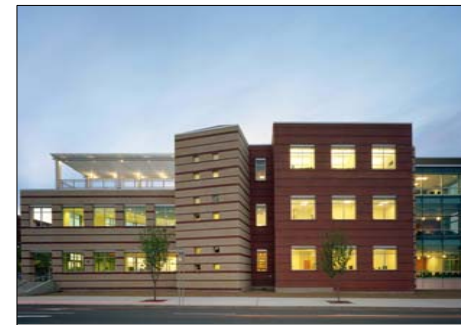
Best Contemporary Design Project - Brick & Stone Pfizer Clinical Research Unit New Haven, Connecticut Architect: The S/L/A/M Collaborative Mason Contractor: Lombardo Bros. Masonry, LLC Owner: Pfizer Corporation CM: Whiting-Turner Contracting Company Engineer: The S/L/A/M Collaborative