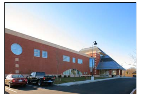
Institutional Category - Courthouses Rhode Island Traffic Tribunal Cranston, Rhode Island Architect: Edward Rowse Architects, Inc. Mason Contractor: M. DiSandro Masonry, Inc. CM: O. Ahlberg & Sons, Inc. Owner: State of Rhode Island Engineers: Odeh Engineers, Inc